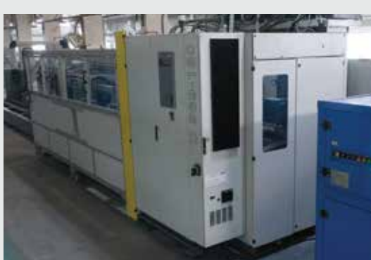
Stator Injection Machine Injection Length - Up to 8000 mm