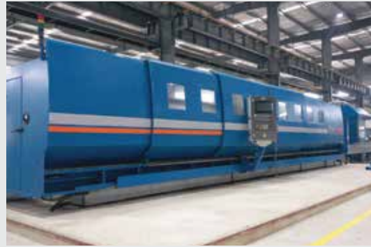
5 AXIS Rotor Cutting Machine Machining Length - Up to 75 mm Dia. - Up to 300 MM