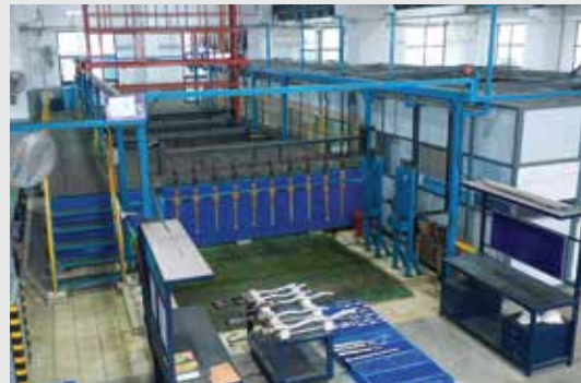
Hard Chrome Plating Facility Length - Up to 8500 mm