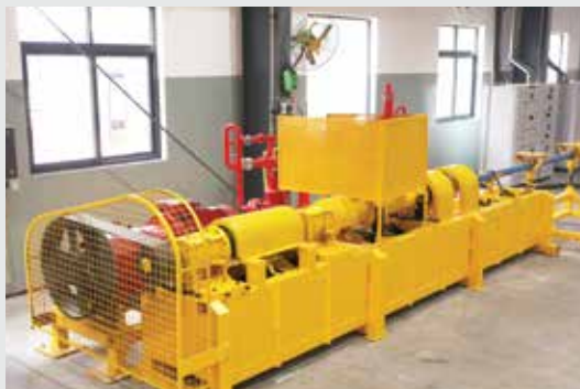
Artificial Lift Down Hole PC Pump Test Bed