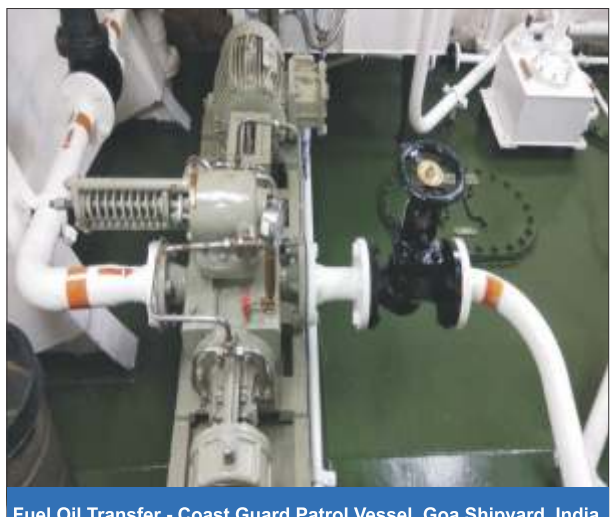
Fuel Oil Transfer - Coast Guard Patrol Vessel, Goa Shipyard, India